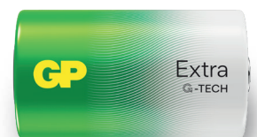
Model No.: GP13AX